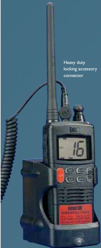
Heavy duty locking accessory connector